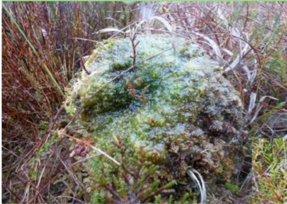
Still affected (close to former source)