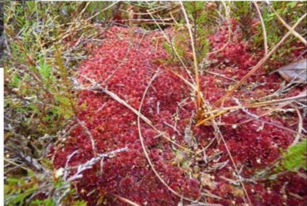
Recovering (away from former source)