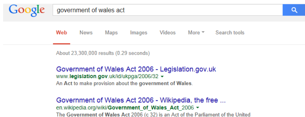
Figure 4, Searching for the Government of Wales Act on Google. legislation.gov.uk is often the first result, by design.

It is very easy to find and access legislation for Wales using Google, Bing or another search engine. The legislation sought may be provisions in a Welsh Act, Measure or Statutory Instrument. For many users in Wales, they may also need to consult UK legislation that extends or applies to Wales. There is no difference for users, in terms of ease of search from a search engine, between these legislation types.