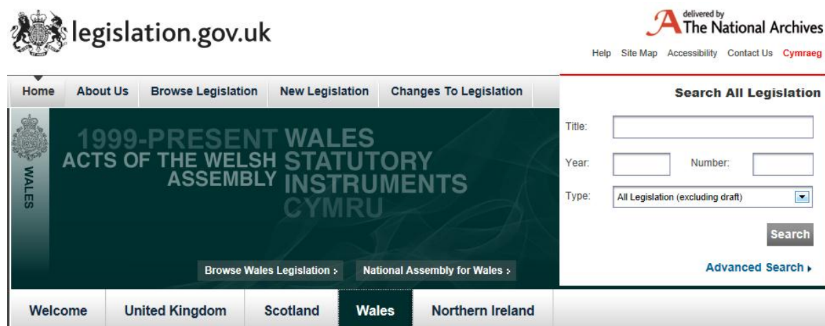
Figure 1, the legislation.gov.uk homepage for Wales

We provide public access to legislation to the people of Wales. As part of the official responsibilities for legislation that sit within The National Archives, we publish all Acts of the National Assembly for Wales and Wales Statutory Instruments, in print and online at www.legislation.gov.uk . To do this we work closely and collaboratively with the Welsh Government, to ensure high quality public access to all legislation that extends or applies to Wales. This collaboration includes continuous service improvements for users.