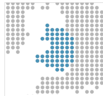
Figure 2, Browsing Wales legislation on legislation.gov.uk