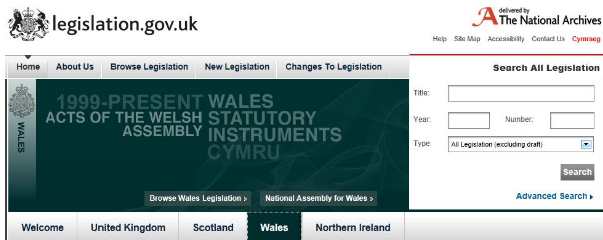
Figure 1, the legislation.gov.uk homepage for Wales

We provide public access to legislation to the people of Wales. As part of the official responsibilities for legislation that sit within The National Archives, we publish all Acts of the National Assembly for Wales and Wales Statutory Instruments, in print and online at www.legislation.gov.uk . To do this we work closely and collaboratively with the Welsh Government, to ensure high quality public access to all legislation that extends or applies to Wales. This collaboration includes continuous service improvements for users.