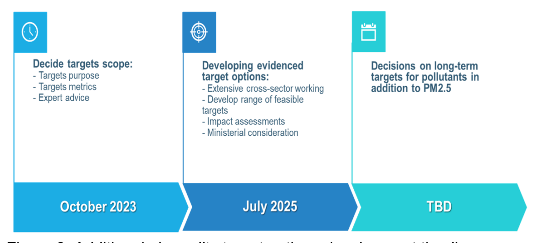
Figure 3: Additional air quality target options development timeline