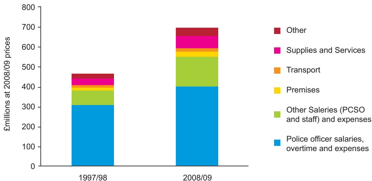
Figure 1 – Police spending in Wales, 1997-98 and 2008-09