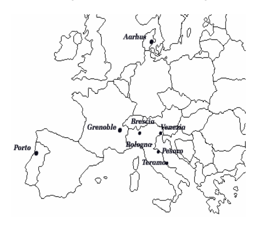
Figure 2: the 8 SHE pilot projects

Each of the 8 pilot projects (Fig. 2) provides concrete examples of integration of sustainability by means of long-term management of land, water, waste, energy and natural resources in social housing and of integrating close participation of citizens in the decision-making phases of urban management.